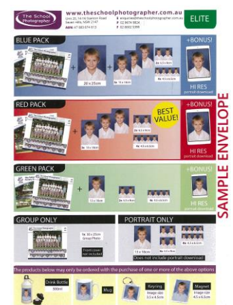
Photo envelopes will be sent out early in Term 1.

Thursday 28th February 2019 – P2, Class and Individual photo, Sibling Photos and Individual Photo Catch up for students absent on first photo day.